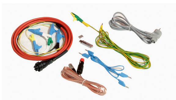
Test lead 5, 10, 15, 20 m