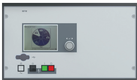
19" version for vehicle