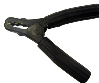
Connection set for HV connections

The information in this document is subject to change without notice and should not be construed as a commitment by Megger Germany. Megger Germany assumes no responsibility for any errors that may appear in this document.