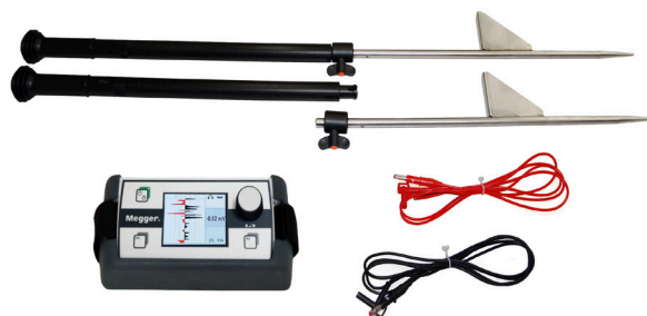
ESG NT / ESG NT2 earth fault probe for DC step voltage